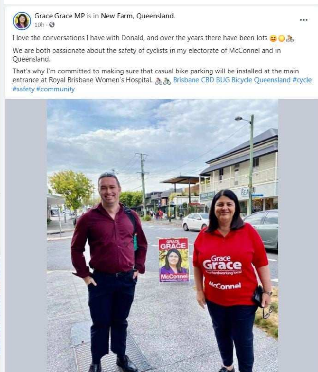
Figure 1 & 2 - Election commitments