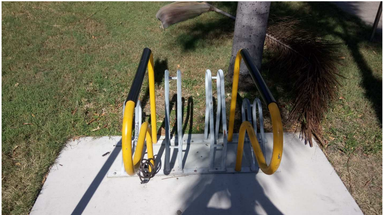
Figure 5 – incorrect installation limits bike rack capacity to 3 not 4 bikes.